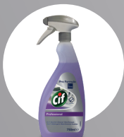
CIF 2IN1 KITCHEN CLEANER DISINFECTANT