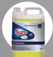
SUN 2IN1 DISHWASHER DETERGENT & RINSE AID